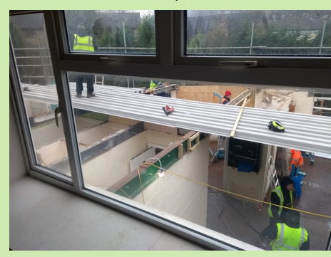
The new deck goes on