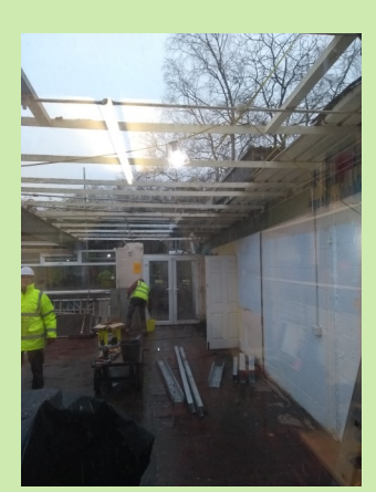
The shop with no roof on