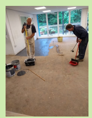
Painting the floors