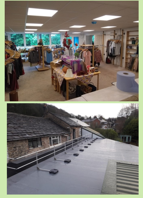
The finished job