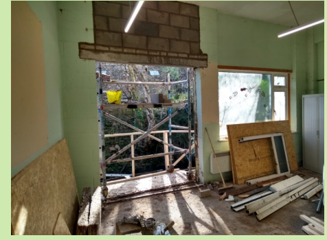
Installing the new French doors in the Education Room