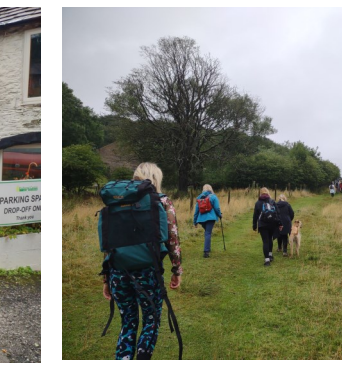
The big hill!