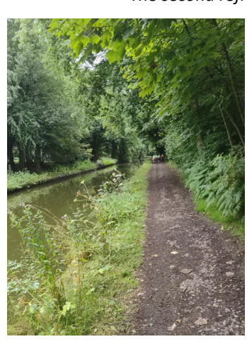
The final stretch on the canal