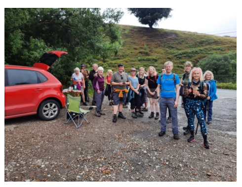
The first refreshment stop