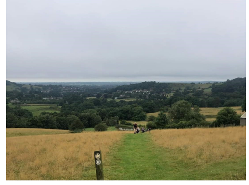
Coming up the big hill!