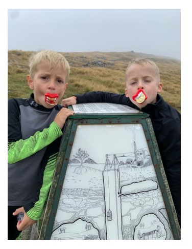
Bridgend Trig point