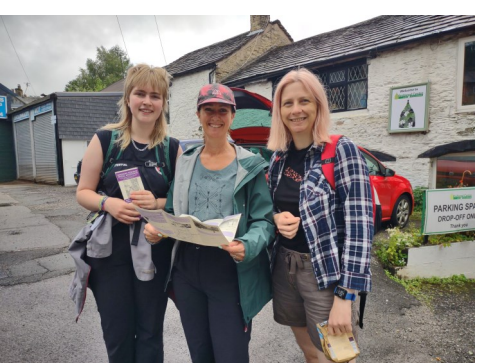
Setting off on the Gritstone