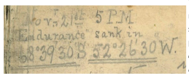
Worsley's diary entry for Endurance's last position.

21<sup>st</sup> century expeditions to the Antarctic can use much more powerful ships than those of 100 years ago. Endurance22 was based on the South African ice breaker S.A. Agulhas II, capable of making 5 knots through 1-meter-thick ice. She carries state-of-the-art Autonomous Underwater Vehicles (AUVs) which can operate to depths of up to 4,000 meters, and can be equipped with either acoustic sensors or, if they find Endurance, laser scanning and cameras to record the scene and build a 3D model of the ship.