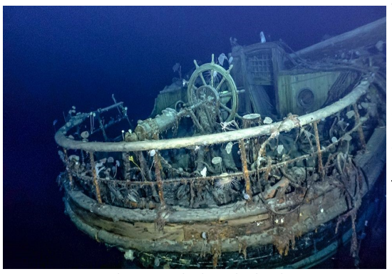
The stern deck and wheel

"The discovery was made at 1605 hrs GMT on 5th March, 2022, in 3008 meters of water, just over 4 nautical miles southward of Frank Worsley's famous coordinates for the sinking.