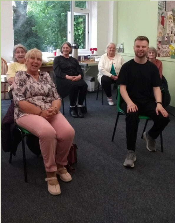
Armchair dancing, one of our weekly activities