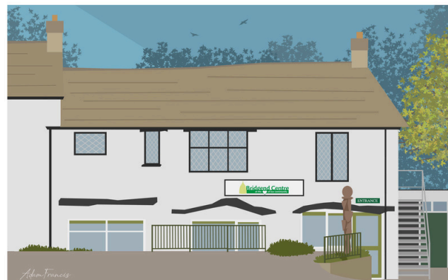
BRIDGEND CENTRE - BOLLINGTON -

Bollington Community Association (known as the Bridgend Centre) is an independent charity (registered charity number 1123287) that plays a hugely important role in Bollington, Cheshire, offering support to everyone in the local community. We work to reduce social isolation and improve people's lives through a range of services, activities and resources.