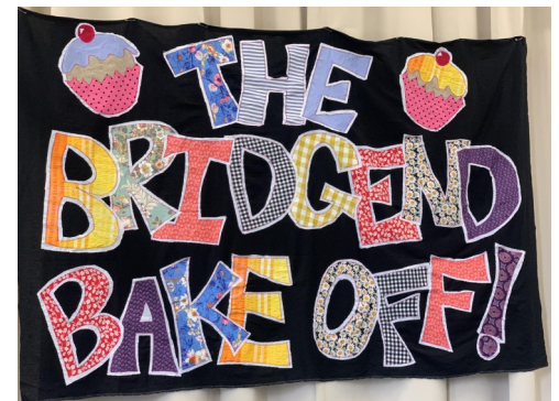
The wonderful Bake-off Banner

A HUGE thank you to every one who gave their time, skills and food to this event, including the judges, musicians, craftspeople who made the banner and